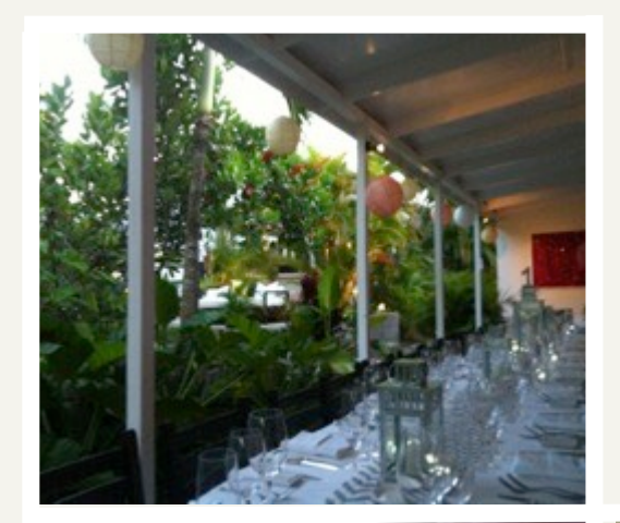
Courtyard Terrace The Courtyard will seat as many as 80 Guests.